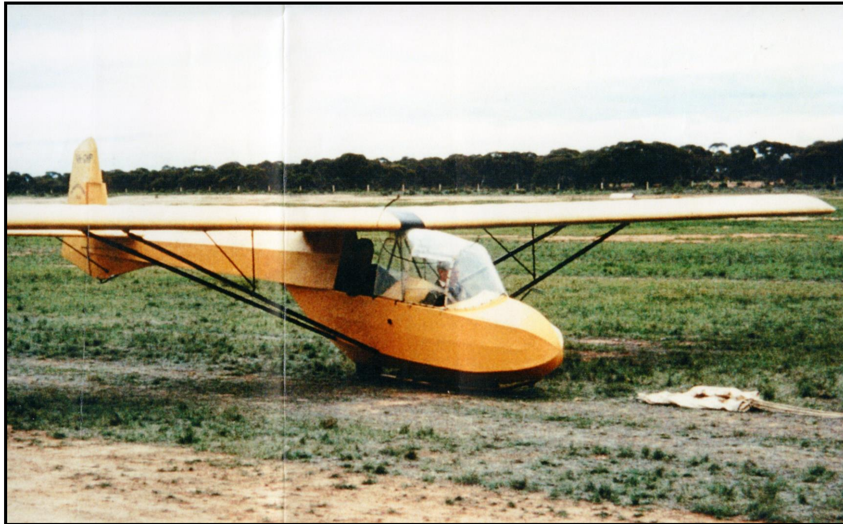
[ES 50 glider at Renmark, South Australia, c 1953; ]