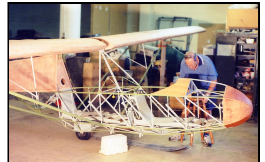
[Trial rigging during restoration]